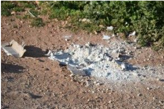
Crater at the third point of impact where the grenade was found

At the third point of impact, an unexploded grenade was found in a crater on a dirt track. This munition was very similar in appearance to that found at the second point of impact.