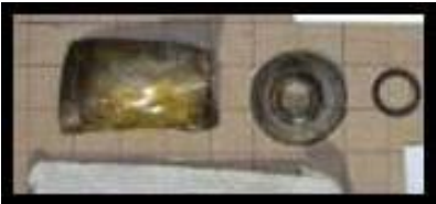
Exploded grenade found at second point of impact

At the first point of impact, there were no victims. At the second point of impact, one person was killed and about 20 injured. An exploded grenade was found in the wreckage. Analysis of biomedical and environmental samples collected by the French services revealed the presence of compounds consistent with exposure to sarin. This analysis was confirmed by the United Nations in December 2013.